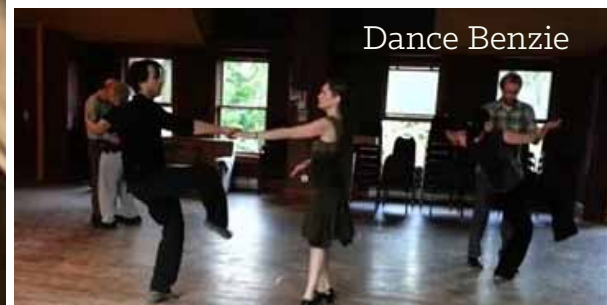
New Jersey's Diversity Youth Theatre