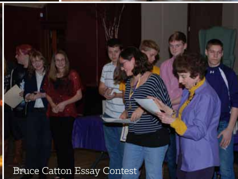
Bruce Catton Essay Contest

The Mills Community House is a 501(c)(3) non-profit and receives no taxpayer funding; operating costs are partially supported by the interest from a small endowment fund, very modest rental fees, and annual contributions (tax-deductible) from residents (both year 'round and seasonal). Please consider using the enclosed envelope for making a donation in support of the Mills Community House fulfilling its stated mission.